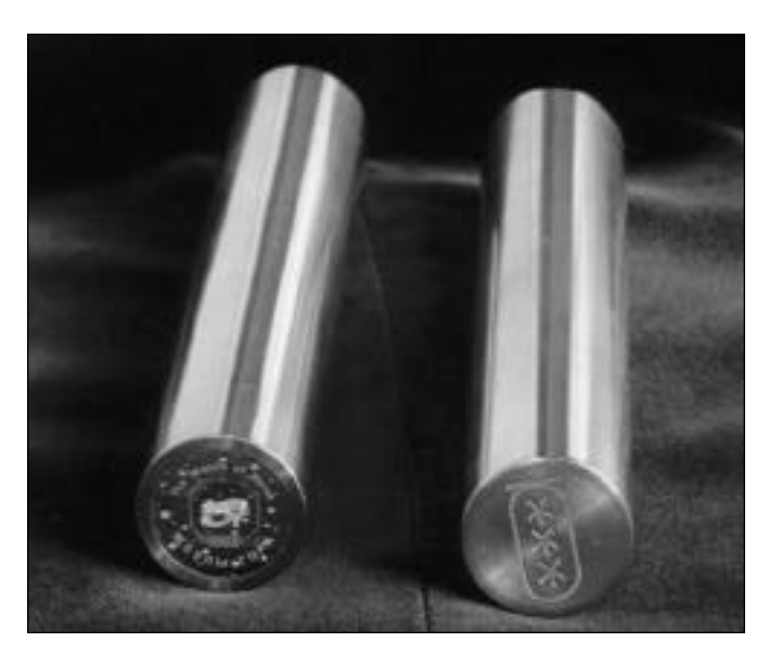
The modern Wands of Horus

quartz in the core is the seismic "respiration" of the Earth. Our planet "breathes" like a living organism. The "inhaling" and "exhaling" are accompanied by changes in the linear dimensions of the Earth as measured in an east-west direction. This "respiration" generates a particular electromagnetic wave which has a strict